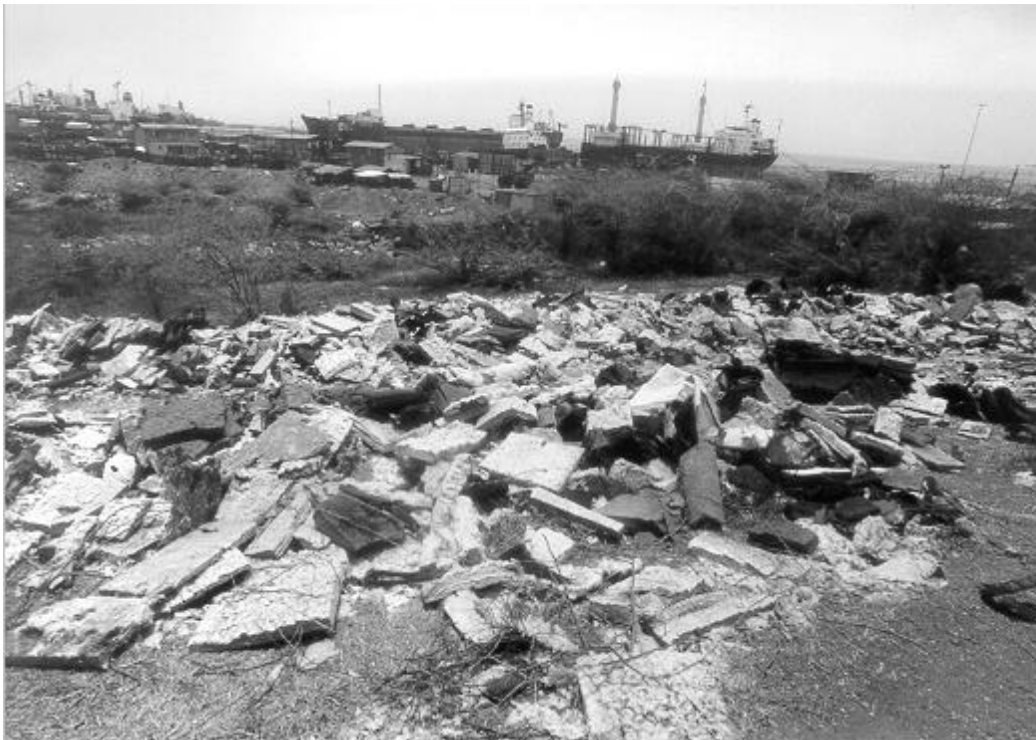
Open dumps; asbestos

The approach road to the plots and the plots themselves remain dangerously congested. This would prove to be a major obstacle to any meaningful emergency response.