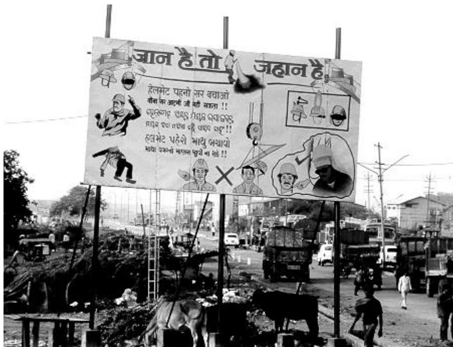
Educational signboard (GMB)

The Gujarat Maritime Board had put up a number of colourful, simple messages encouraging safe work practices among workers.