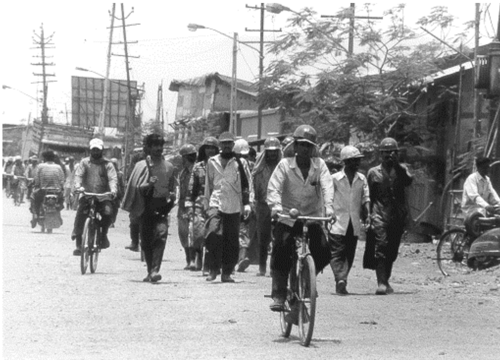
Workers using hard-hats

The Gujarat Maritime Board had put up a number of colourful, simple messages encouraging safe work practices among workers. Several shipbreakers had also put up signboards on safety issues, although the language of communication (English) leaves one wondering whether the target audience is the worker – who speaks Hindi and/or his native language -- or the critical English-speaking visitor.