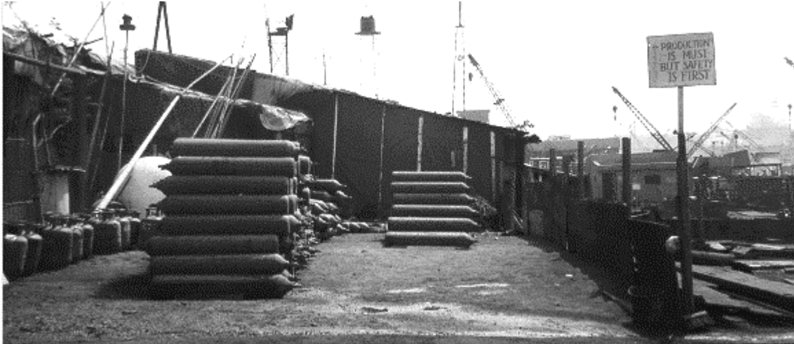
Oxygen and acetylene bottles stacked horizontally

between filled containers that must be stored upright and empty containers that can be horizontally stacked. All visible bottles were horizontally stacked.